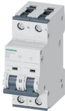
Miniature circuit breaker 400 V 10kA, 2-pole, D, 13 A, D=70 mm